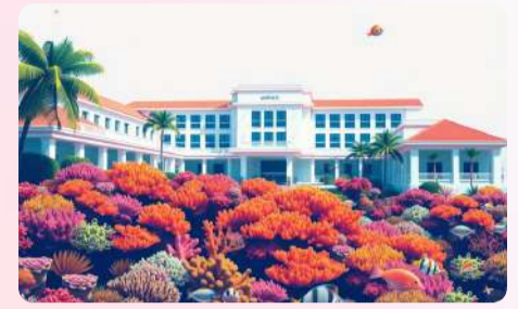
James Cook University