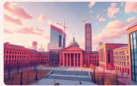
University of Technology, Sydney