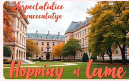
The University of Adelaide