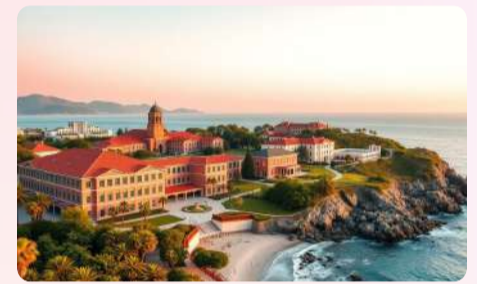
University of Wollongong