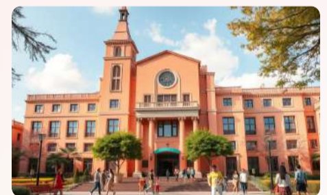
Western Sydney University