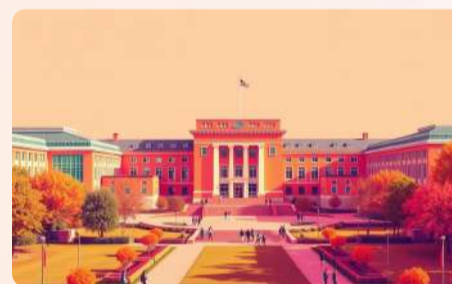
University of Melbourne