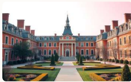
Australian National University