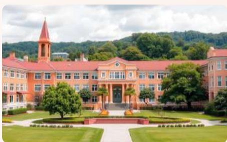
University of Canberra