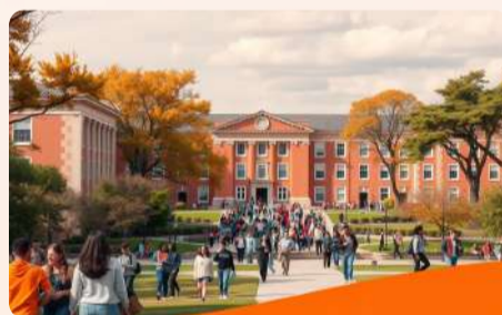
Victoria University, Australia